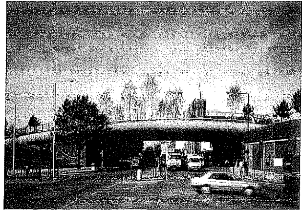
The Green Bridge at Mile End Park Architect: CZWG

In pursuing its objectives ELBA acts primarily as a catalyst and a facilitator rather than a mainstream delivery vehicle.